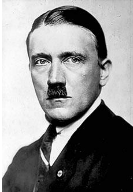
Figure 7: Hitler in 1923

In early November, 1923, Hitler, leading the German Workers Party and its quasi-military wing, the S.A. ( Sturm Abteilung ), attempted to overthrow the Munich municipal government, hoping thereby to galvanize the masses and march on Berlin. This so-called “Beer Hall Putsch” failed miserably; and the following spring, Hitler and his deputy Rudolf Hess, along with other conspirators, were sentenced to five years in jail. Because of sympathy for Hitler’s effort to “save the nation,” he and Hess were confined to a very minimum security compound, Landsberg Prison. During his stay, Hitler was allowed unlimited visitors, any number of books, and his faithful dog. He famously called this time in jail his “higher education at state expense.” 82 While in jail he was visited often