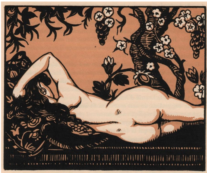
Figure 4: Illustration (1924) by Maurice Becque, in Gobineau's Nouvelles asiatiques .

volumes, a conjectural anthropology whose conclusions, he ceaselessly claimed, had the iron grip of natural law. The beginning of his story, he allowed, did have a bit of mythical aura about it. The Adamite generation, knowledge about which trailed off into fable, begot the white race—about this the Bible seemed certain, while the origins of the yellow and black races went unmentioned in the sacred texts. 46 So we might assume that each of these races had independent roots, since each displayed markedly different traits. 47 The whites were the most beautiful, intelligent, orderly, and physically powerful; they were lovers of liberty and aggressively pursued it. They played the dominate role in any civilization that had attained a significant culture. The yellow race was rather lazy, uninventive, though given to a narrow kind of utility. The black race was intense, willful, and with a dull intellect; no civilization ever arose out of the pure black race. Each of the three races had braches with somewhat different characters. So, for instance, the