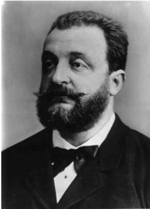
Figure 9: Georg von Schönerer, member of the Austrian Parliament and Leader of the Pan German League.

anti-Semitism to undergo a slow change in the course of time.” “It was,” he said, “my most serious change of opinion.” 120