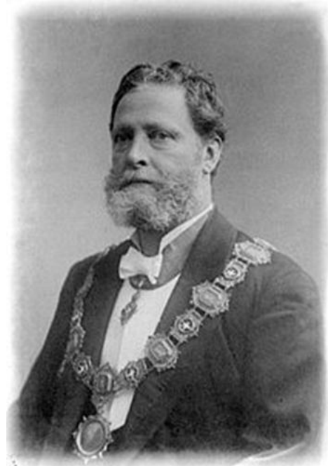
Figure 8: Karl Lueger, Mayor of Vienna (1897-1910).

In Mein Kampf , Hitler is perfectly explicit about the sources of his anti-Jewish attitudes. He identifies two political figures who turned him from an individual hardly aware of Jews into a passionate anti-Semite: Karl Lueger (1844-1910), the mayor of Vienna (1897-1910) and newspaper baron; and Georg Schönerer (1842-1921), member of the Austrian parliament and leader of the Pan German Party, which sought to unite the German speaking lands in a political confederation. Both were large presences in Vienna when Hitler as an 18-year old art student arrived there from Linz in 1908. He claimed that prior to coming to the city he had little experience of Jews, thinking them merely Germans. 118 Vienna was awash in anti-Semitic pamphlets and broadsides, which he said were so exaggerated that he could hardly believe them. But Lueger and Schönerer made clear what was at stake in the Jewish question.