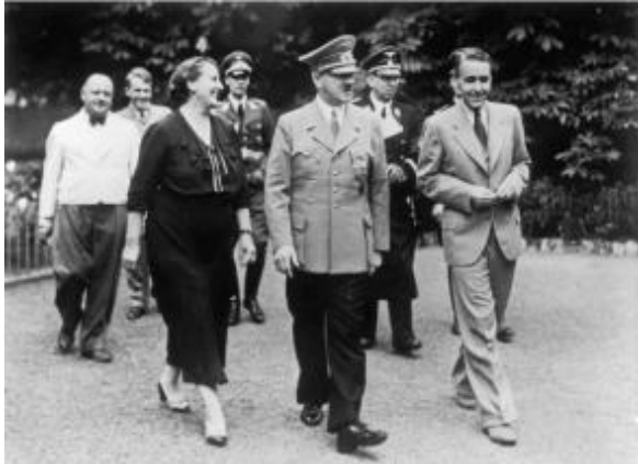
Figure 6: Hitler flanked by Winifred and Sigfried Wagner, son of Richard Wagner, 1933

fanatic overheats the head, while you warm the heart. The fanatic wishes to smother you in words; you want to convince, only convince. . . My faith in Germanness [Deutschtum] has never wavered for a moment. But my hopes—I will confess—had ebbed. With one blow, you have transformed the core of my soul. That Germany in the hour of her greatest need has given birth to a Hitler, that shows her vital essence. 78