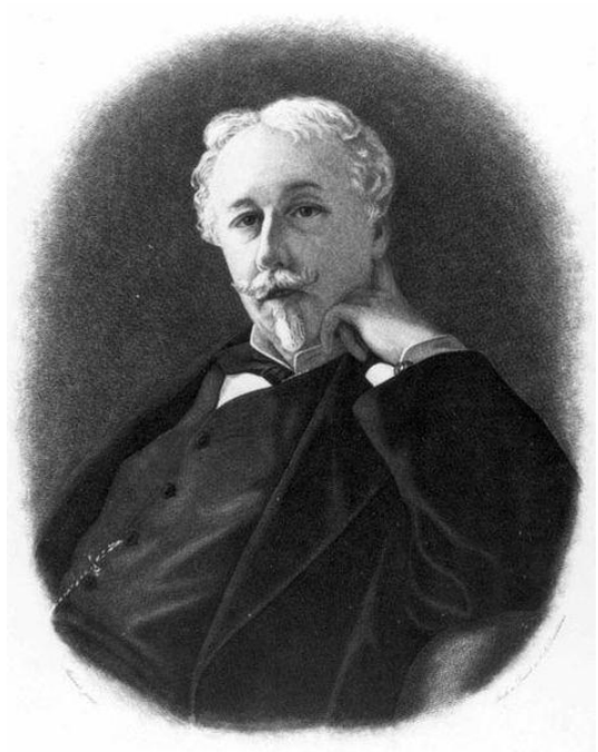
Figure 3: Arthur Comte de Gobineau.

Arthur, Count de Gobineau was born of a royalist family in 1816. His father joined the anti-revolutionary forces during the Directorate and