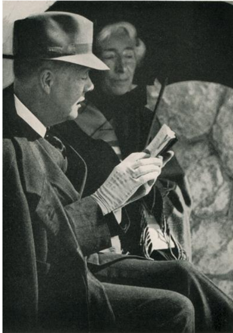
Figure 5: Cosima Wagner and her son-in-law, Houston Stewart Chamberlain, 1918.

measure, perhaps, was the kindling of his admiration for, if not burning love of, Wagner's youngest daughter, Eva, whom he married in 1908 following an expensive divorce from his first wife.