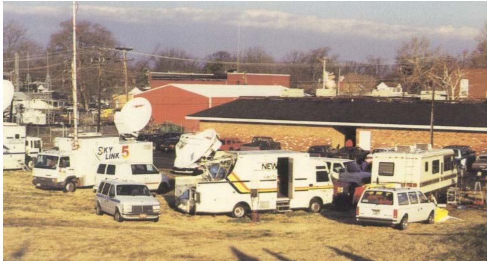
Figure 2. News Media in New Madrid, Missouri on 3 December 1990 awaiting the earthquake predicted by Iben Browning

Recognizing the potential for large earthquakes in the Midwest, a number of organizations have been formed and existing agencies re-focused to address the estimated loss of life and property from future earthquakes in the NMSZ. 65 In 1983 seven states (Arkansas, Illinois, Indiana, Kentucky, Mississippi, Missouri, and Tennessee) formed the Central United States Earthquake Consortium (CUSEC) to improve public awareness and education. CUSEC is located in Memphis, Tennessee and is active in a number of earthquake related programs, such as coordinating the emergency response of the Departments of Transportation in the seven states, coordinating the studies of the State Geological Surveys in the seven states, and continuing earthquake awareness and education activities in the NMSZ.