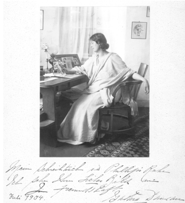
Figure 1.2: Isadora Duncan (1877-1927): “My writing table at Phillips Ruhe. I look upon your lovely picture. Yours in friendship, Isadora Duncan, July 1904.”

the last part of the nineteenth century and allowed him to cultivate relationships with such political, intellectual, and artistic luminaries as Edward Aveling (consort of Karl Marx's daughter and translator of Das Kapital ), David Friedrich Strauss (theologian and iconoclastic author of the Life of Jesus ), Ernst Mach (positivist and physicist at Vienna), and Isadora Duncan (free-lover and dancer).