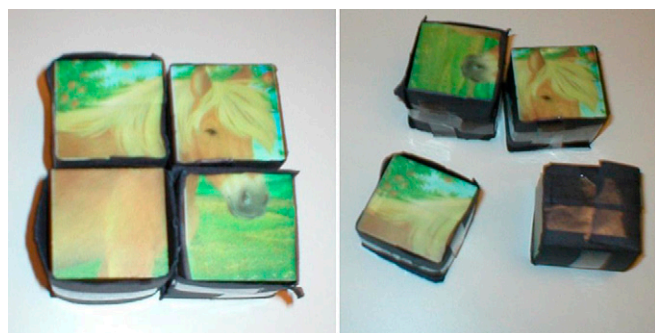
Fig. 1. The puzzle used in the experiment. Subjects solved a four-piece jigsaw puzzle. The time that it took to complete the puzzle acted as our measure of spatial ability.

Fig. 2 and Table 1 (consistent with other cross-cultural studies) (15), we find a main effect of culture on spatial abilities; however, unlike other cross-cultural studies, Fig. 2 and Table 1 also indicate an interaction effect between gender and culture. Men take 36.4% less time than women among the patrilineal society (ordinary least squares, P < 0.001 , n = 468 ) but are no faster among the matrilineal society (OLS, P = 0.252 , n = 811 ). The interaction between gender and society is statistically significant (OLS, P < 0.001 , n = 1,279 ). SI Text shows the robustness of these results.