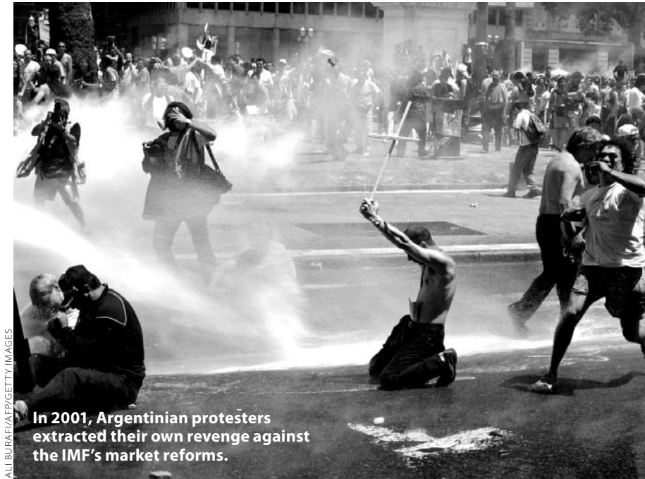
In 2001, Argentinian protesters extracted their own revenge against the IMF's market reforms.