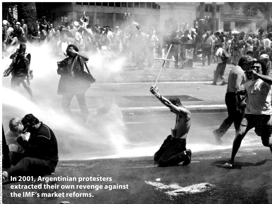
In 2001, Argentinian protesters extracted their own revenge against the IMF's market reforms.

Sanderson around the bend. “This happens to be the political rhetoric: ‘These 200 corporations dominate the world.’ They don’t. They’re a very small percentage of GDP,” Sanderson says. “Those who are criticizing very large multinational corporations are doing a disservice if they don’t get the math right.”