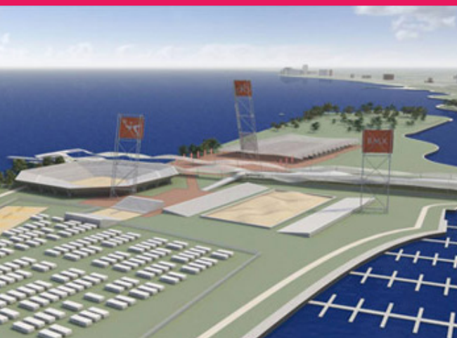
OLYMPIC SPORTS COMPLEX AT NORTHERLY ISLAND — BEACH VOLLEYBALL, BMX, TRACK CYCLING

Located on Chicago's rapidly developing near South Side just west of the lake, the Olympic Village was to provide convenient, picturesque housing for 16,000 athletes and officials. Eighty-eight percent of athletes would have been within 15 minutes of their competition venues. After the games, it was to convert to mixed-income housing.