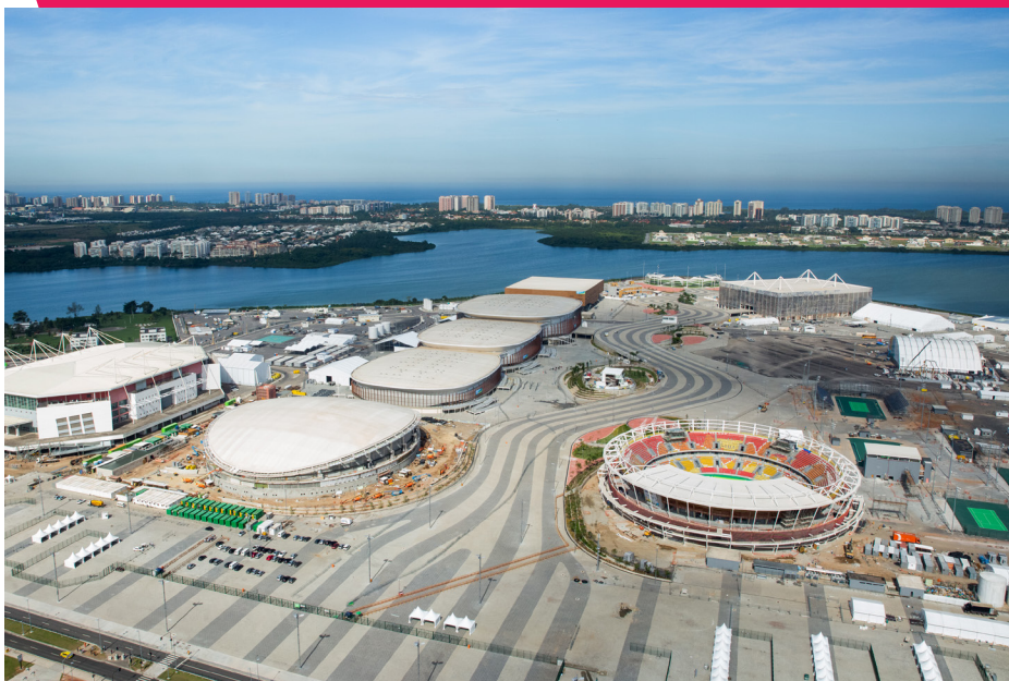
TOP: Aerial view of Baía de Guanabara, Rio de Janeiro, Brazil, March 12, 2019. BOTTOM: Barra Olympic Park in 2016.

Michael Phelps swam for five gold medals and one silver in his fifth Olympics; with 28 medals, he became the most decorated athlete in the modern Summer Games history. Gymnast Simone Biles won four gold and a bronze, a feat she is predicted to surpass in Tokyo this year. The first Olympics in South America, the Rio Games cost $20 billion, including $2.06 billion for 34 sports venues (nine of them permanent), $8.2 billion for a subway line that ensured nearly half the athletes could reach their venues in 10 minutes and 75 percent in 25 minutes; for renovation of an historic port area and cleanup of polluted Guanabana Bay.