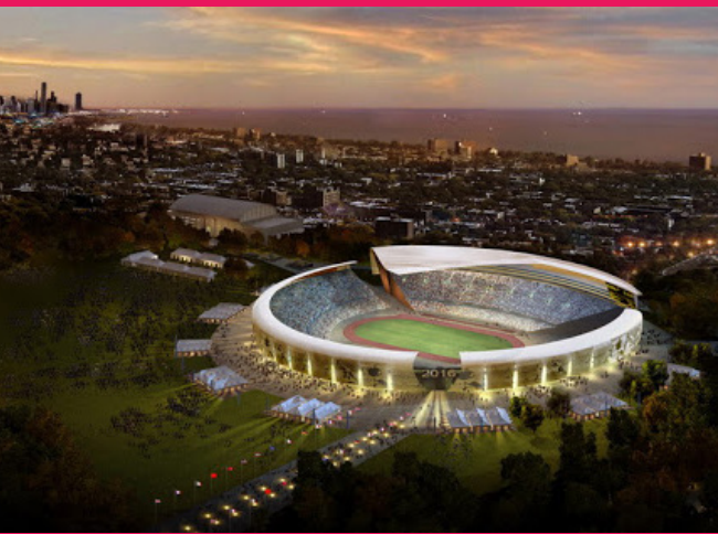
OLYMPIC STADIUM (OVERHEAD VIEW) - OPENING AND CLOSING CEREMONIES, ATHLETICS

Chicago's Olympic Stadium, designed and built specifically for the 2016 Olympic Games, would have rested in 100 acres of historic parkland in the Washington Park neighborhood. The stadium would have hosted the opening and closing ceremonies, as well as the athletics competition. This facility represented both innovative and responsible construction, with the ability to accommodate crowds of 80,000 for the Games, then being reduced to a community-friendly amphitheatre post-Games.