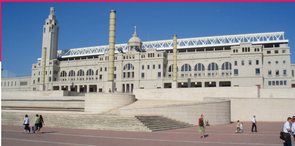
TOP: The Olympic Park in Barcelona, Spain.

An NBA team comprised of Michael Jordan, Patrick Ewing, Larry Bird and Charles Barkley took basketball gold, while new teams competed from former Soviet bloc nations and post-apartheid South Africa. The cost of the Games accounted for just 9.4% of the $9.3 billion spent to prepare the city, from new roads, to airport renovation, to two miles of beaches reclaimed from industrial slums. In the process, Business Insider said the city rose from 11th to 6th most popular in Europe.