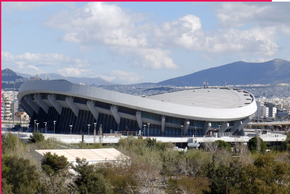
TOP: Olympic flame at the opening ceremony of the Athens 2004 Summer Olympics. BOTTOM: Peace and Friendship Stadium hosted volleyball in Athens.

The birthplace of the ancient Olympics and the site of the first modern Games in 1896, Athens drew 11,000 athletes from 202 nations in 2004. Swimmer Michael Phelps topped the medals count, with six gold and two bronze. Preparations included a new airport, expanded public transport, and permanent sports infrastructure, which some economists say contributed to a Greek debt crisis.